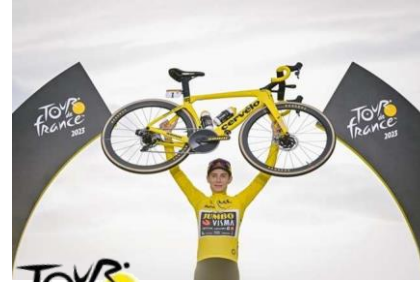
TOUR de France 21 Wins (including 2023 Male & Female)