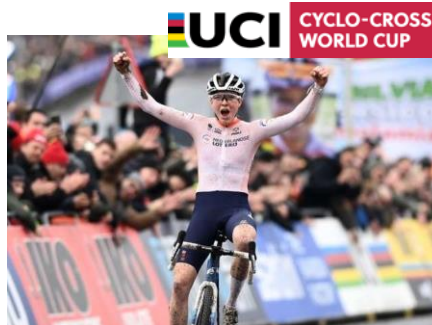
2023 #1 Male & #1 Female