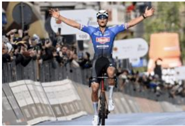
16 Wins (including 2023)