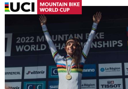
UCI MOUNTAIN BIKE WORLD CUP