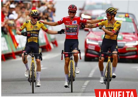
LA VUELTA 13 Wins (including 2023)