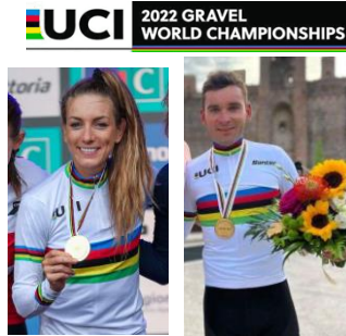
2022 #1 Male & #1 Female

>60% World Tour Victories Used Vittoria Group Products