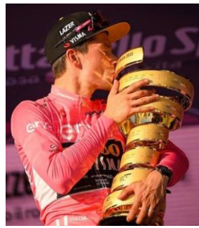
Giro d'Italia 19 Wins (including 2023)