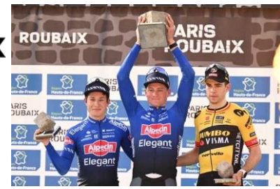
20 Wins (including 2023)