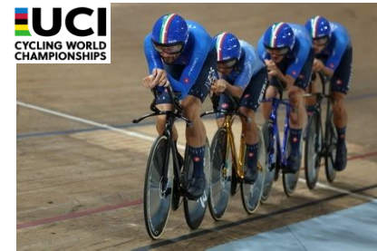
> 50% of medals won