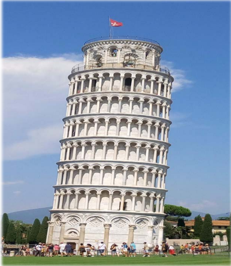
Leaning Tower of Pisa, Italy