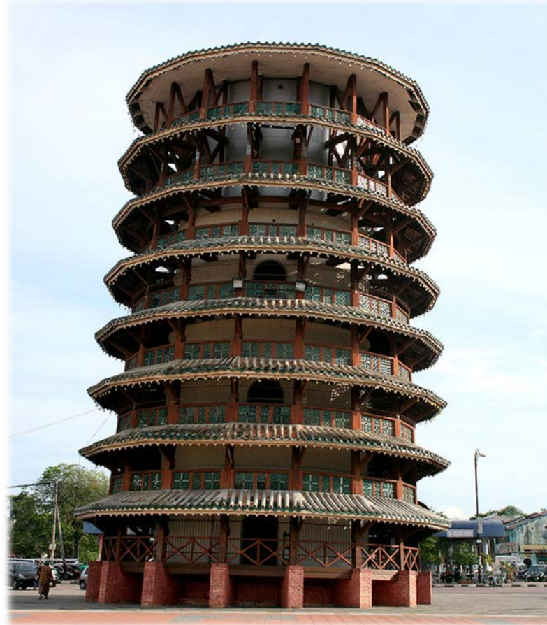
Leaning Tower of Teluk Intan, Malaysia