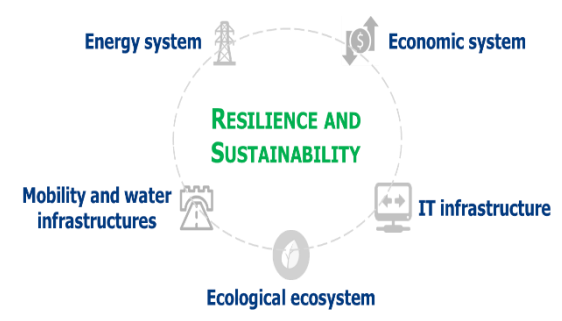
Figure 2. Interconnected aspects underpinning the resilience and sustainability framework.

The sharp economic growth in ASEAN countries is raising concerns about sustainability, as the region is called on to face the trade-off between economic development, on the one hand, and sustainable management of natural resources and socio-economic integration and equality, on the other. In order to understand the ASEAN progress towards improving sustainability, it is necessary to investigate the issue from a range of perspectives, including the measures needed to improve economic, social and environmental resilience. In particular, the concepts of sustainability and resilience refer to different interconnected aspects of the socioeconomic and environmental ecosystem: the socio economic system (the ability to promote integration and quality of life within the context of economic growth), the energy system (the ability to guarantee sustainable energy production and continuity of energy supply throughout all countries), the mobility and water infrastructure system (the ability to provide a systemic and widespread physical connection within and among countries), the IT system (the ability to provide an adequate level of IT and digital services, in the face of potential faults and challenges) and the natural and ecological system (the ability to manage perturbation or climate changes and resource depletion, including natural disasters).